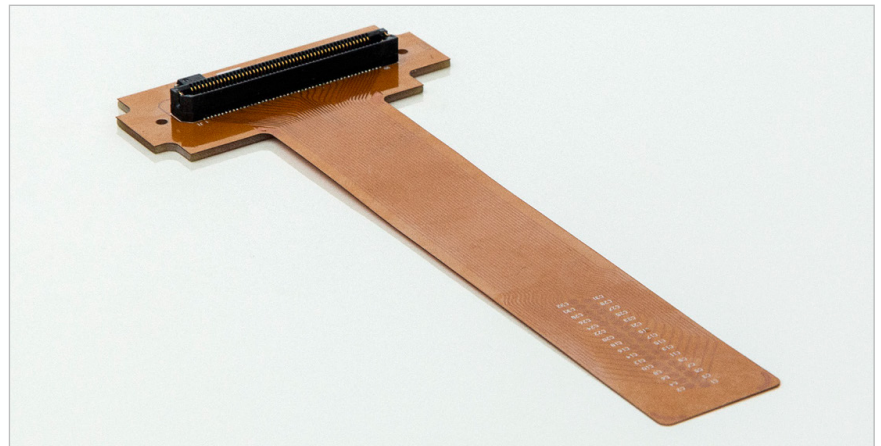
Figure 3: P-Flex probe highlighting the coil sensors printed directly on its flexible board.