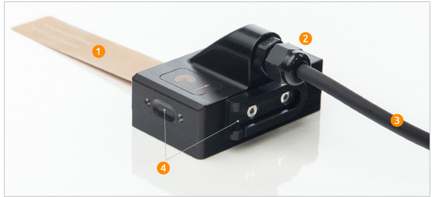
Figure 2: The P-Flex probe connected to its cable adapter.

To cover maximum inspection scenarios and offer the ideal compromise between coverage and detection performance, the P-Flex probes are available in three formats with different coil sizes: small, medium, and large. Selecting the right probe should be based on the smallest defect to detect, the required coverage of the array, and the nature of the material being inspected (ferromagnetic or not).