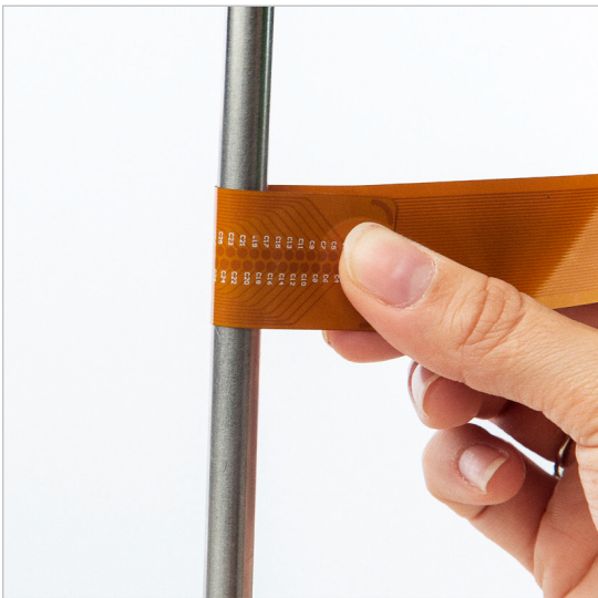
Figure 1: Thin ultra-flexible array of coil wrapped around a pipe.

With printed coil density at the forefront of current probe technology, the P-Flex offers a higher signal-to-noise ratio (SNR) and coil uniformity compared to other printed probes on the market. Powered by Eddyfi Technologies' SmartMUX and advanced multiplexing topologies, this probe family delivers an unrivaled probability of detection of small flaws.