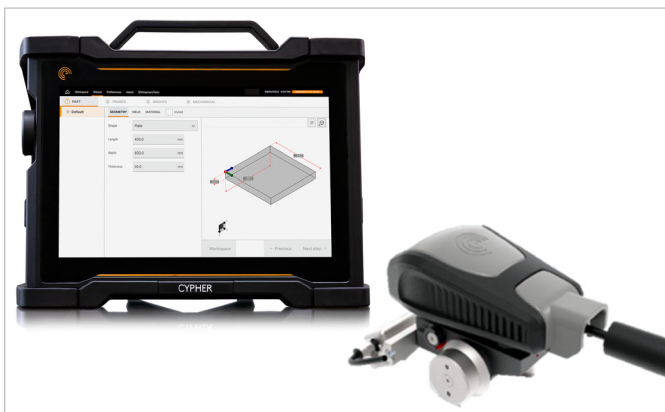
Figure 11: PaintBrush 2 coupled with the industry-leading Cypher ultrasonic instrument.

When there is need to cover larger areas, the use of a lightweight fixed frame XY scanner may be the preferred choice. Boasting an array of application deployment options including the aquablock waterbox for localized immersion corrosion mapping, linear array probes with OL wedge and dual linear array probes.