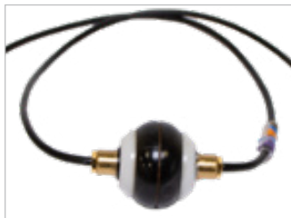
Figure 6: Twin crystal wheel probe.