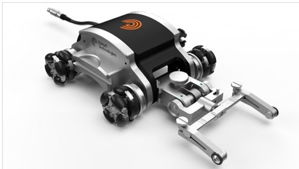
Figure 10: Semi-automated NDT Sweeper for corrosion and weld inspections.

The PaintBrush 2 is an advanced semi-automated corrosion mapping scanner designed for optimal versatility. Its double encoded wheels allow tracking of probe position and orientation, while also allowing accurate mapping even around obstacles.