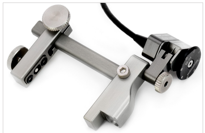
Figure 13: ODI manual encoded scanner.