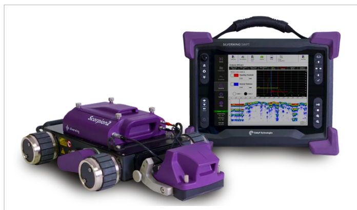
Figure 8: Swift and Scorpion 2 remote-access tank shell ultrasonic inspection solution.

API 650/653 compliant, this powerful system is the perfect solution for in-service inspection of large assets.