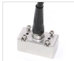
Figure 4: Linear array probe.