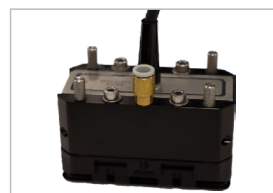
Figure 2: Local immersion PAUT probe.