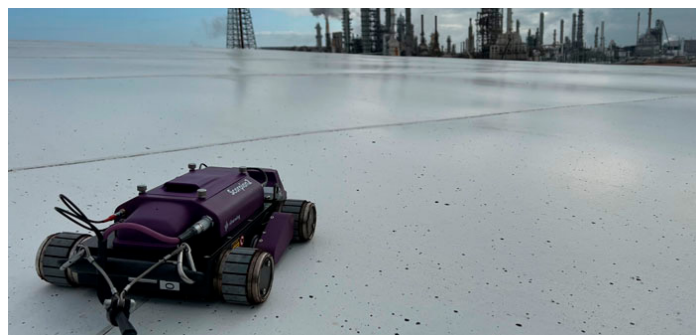
Figure 9: Scorpion 2 inspecting tank roof.