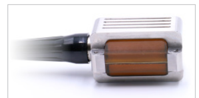
Figure 3: Dual linear array probe.