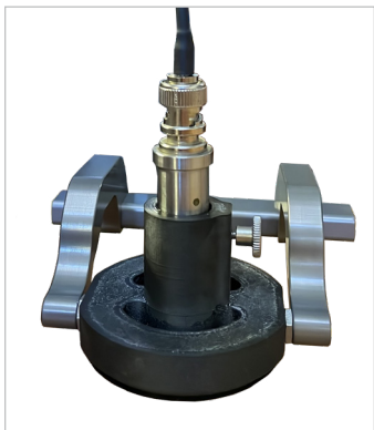
Figure 5: Single crystal probe with a local immersion water column.