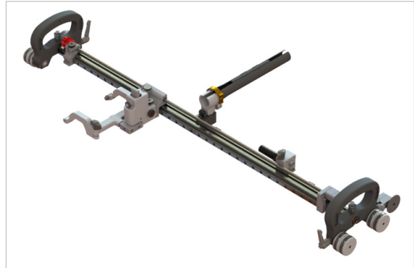
Figure 12: Compatible with local immersion corrosion mapping for high tolerance to surface roughness and imperfections.