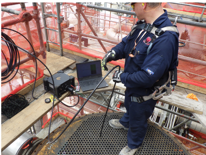
Figure 2: Heat exchanger inspection with an RFA probe paired with the Ectane® 3.