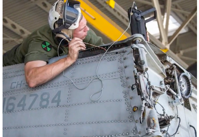
Figure 4: Crack detection around fasteners with MIZ-21C.

Pencil probes are an option for detecting small cracks in close proximity to fastener holes. The inspector uses a known crack or notch standard to set up the MIZ-21C signal display. Then, while scanning the test piece, the inspector can estimate the depth and length of surface cracks by comparing the phase and amplitude of the generated eddy current signal to the standard's signal. A fast, simple option is to use the available surface array capabilities of the MIZ-21C instrument and Surf-X Array probe. This approach can simplify the inspection and complete it in a fraction of the time compared to more traditional methods.