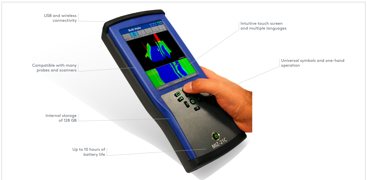
Figure 1: Annotated breakdown of MIZ-21C.