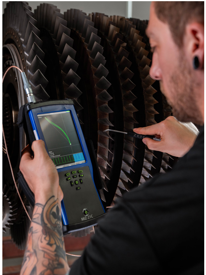
Figure 2: Blade inspection with MIZ-21C.