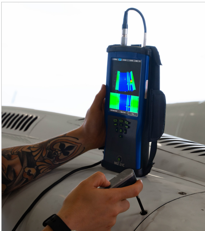
Figure 3: Aerospace bolt hole inspection

Identifying corrosion is one of the most critical and complex aspects of airframe inspections. Changes in skin thickness as well as varying multi-layer structures usually make it difficult to recognize signals. The MIZ-21C has the power to penetrate thick sections. Exceptional signal-to-noise ratio helps inspectors distinguish even a small loss of material. Dual-frequency with mixing nearly eliminates the unwanted signals caused by varying air gaps between layers that can “mask” the signal of interest.