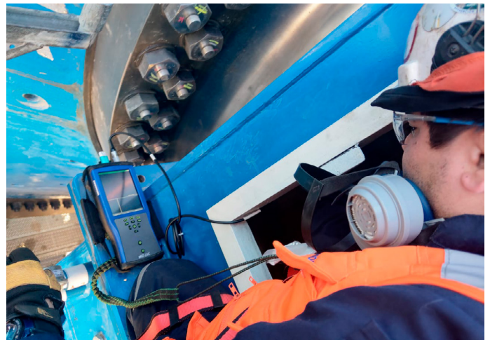
Figure 5: MIZ-21C performs conductivity and coating thickness measurement.

Use digital conductivity measurements (resistivity) to characterize/sort materials. Directly measure the conductivity of metals and alloys, such as aluminum structures, using dedicated conductivity probes that have a broad operating frequency range. Or measure a nonconductive coating such as paint. The MIZ-21C offers a wide measurement range for both conductivity and thickness.