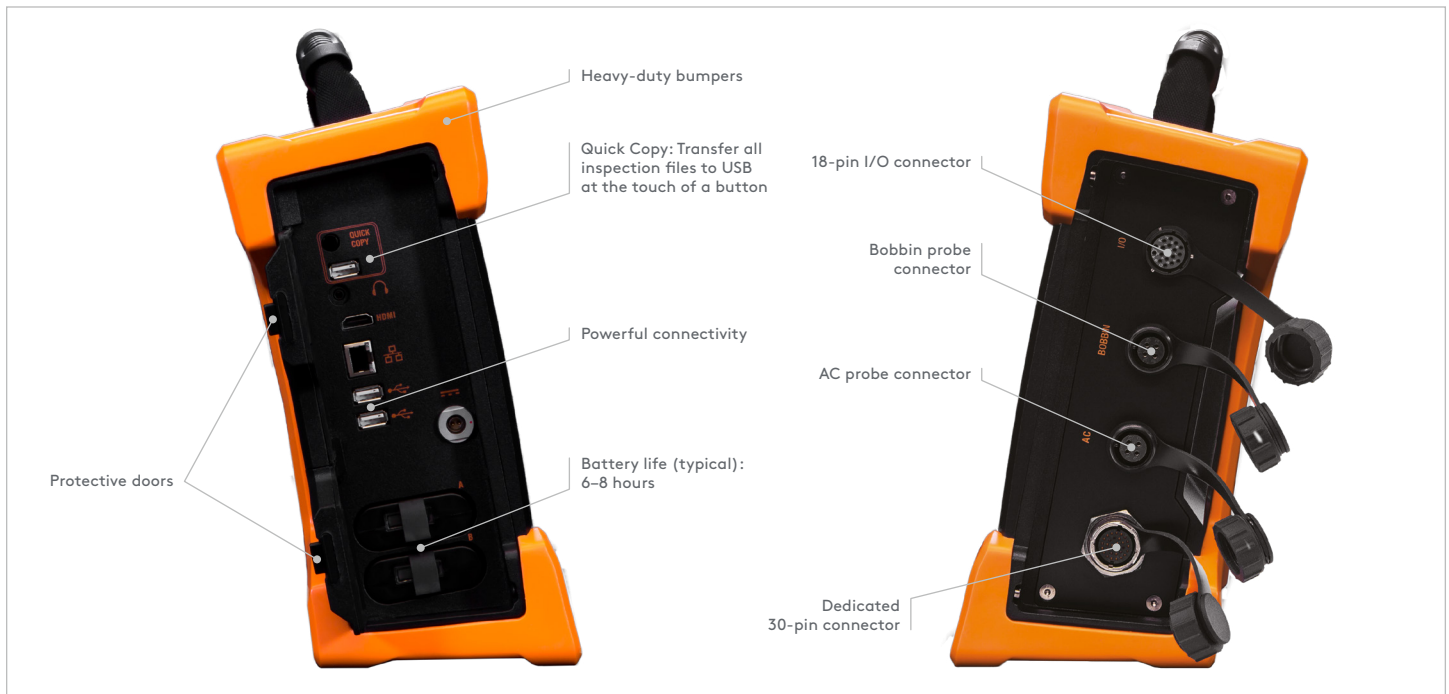
Figure 3: Annotated breakdown of Reddy showing its key features.