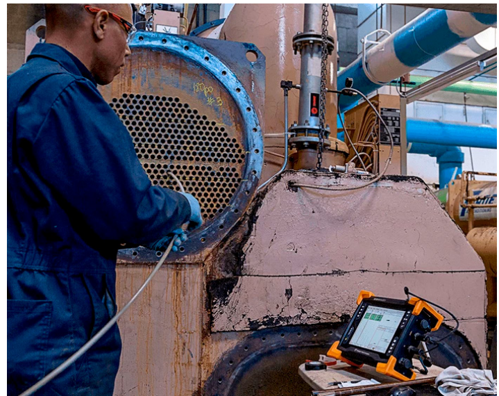
Figure 5: Reddy AC heat exchanger tube inspection.