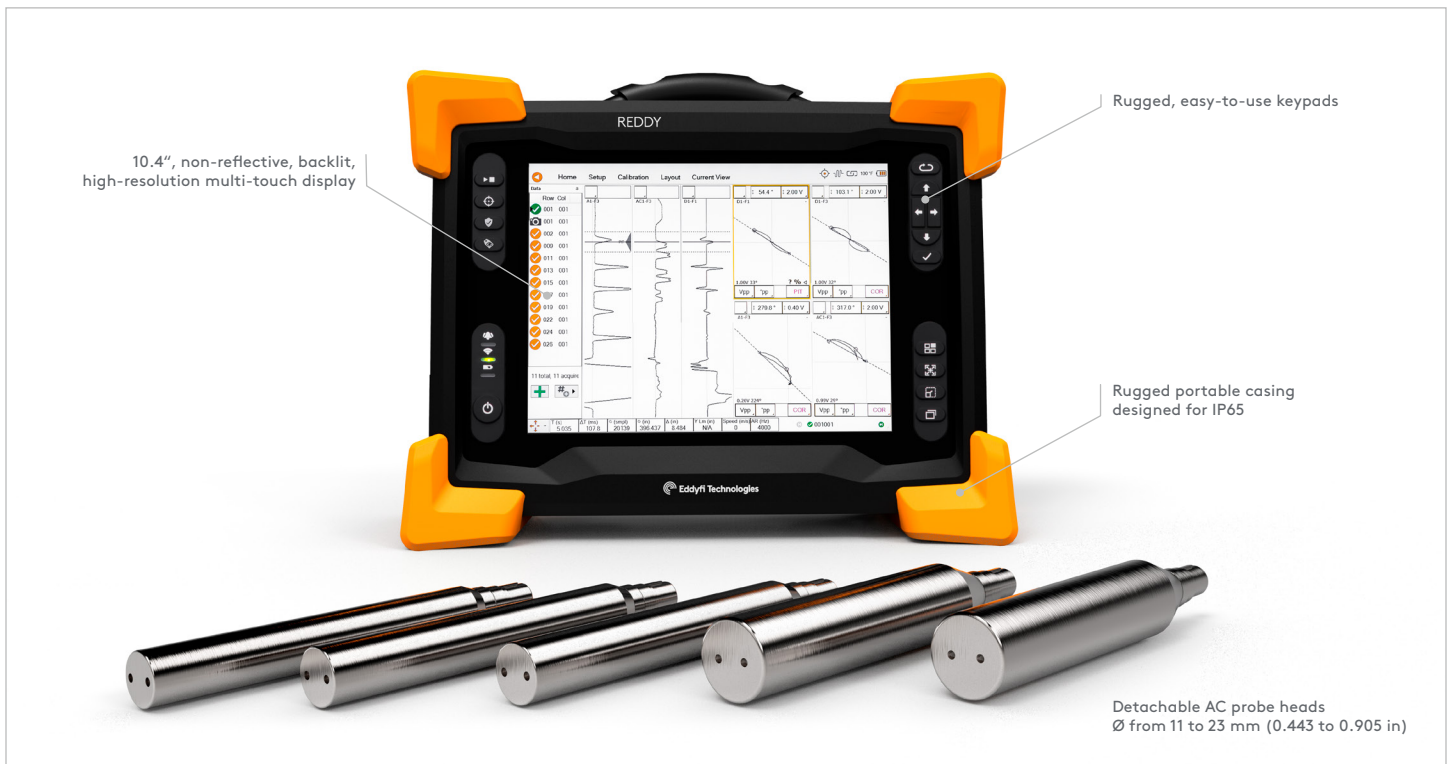
Figure 1: Annotated breakdown of Reddy showing its key features.